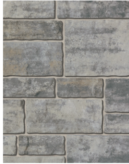
CORTONA Multi Bundle