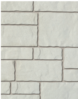
POLAR WHITE ✦ Multi Bundle