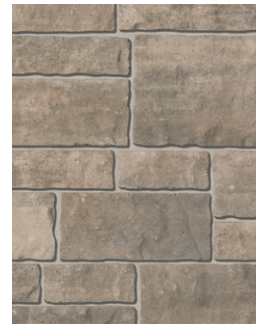
VERONA Multi Bundle