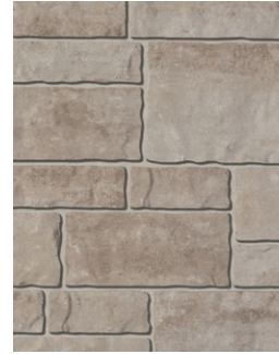
MILANO Multi Bundle