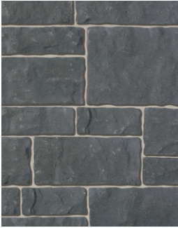
CHARCOAL Multi Bundle

All colours shown are Stock Item Products. Manufactured in our Brampton, Ontario plant.