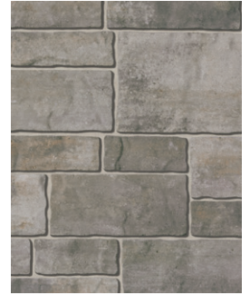
PALERMO BEIGE Multi Bundle