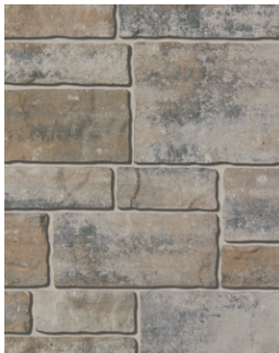
SIENA Multi Bundle