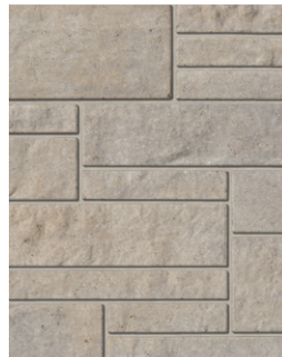
SUNRISE Multi Bundle †