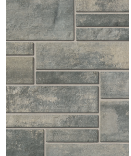
MARBLE GRAY Multi Bundle †