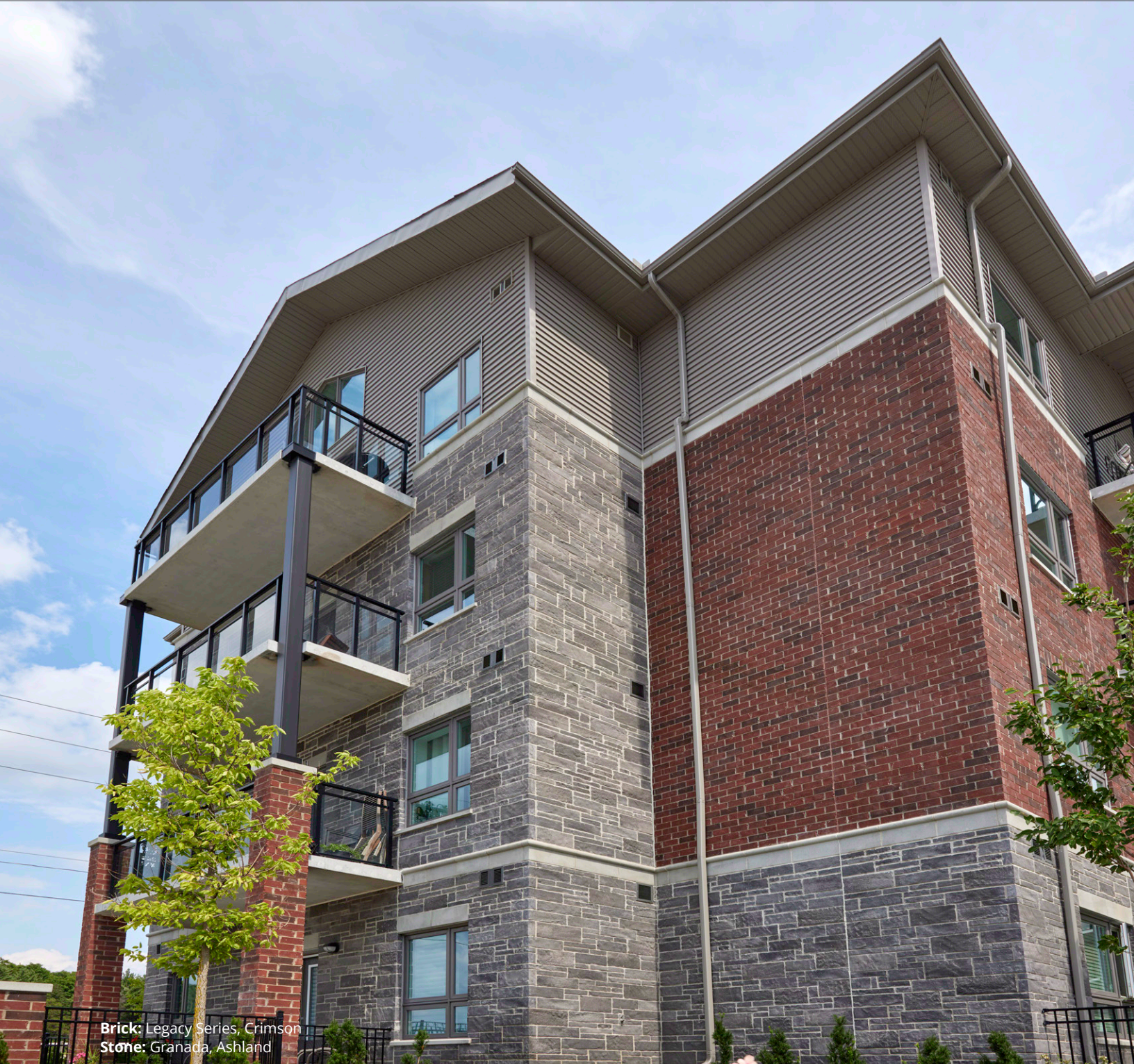
Brick: Legacy Series, Crimson Stone: Granada, Ashland

Fresh, marbled colour compositions make Granada an adaptable stone for today's chic design trends. Offered in an array of alluring colours, Granada's unique textures combine easily with our clay and concrete bricks especially well with the sleek, smooth Contempo for unique design options.