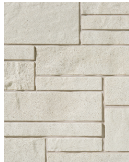
POLAR WHITE ✖ Multi Bundle †