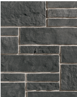
MIDNIGHT Multi Bundle †