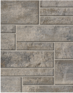
ASHLAND Multi Bundle †