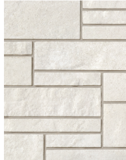
ICELAND WHITE ✖ Multi Bundle