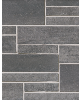
CINDER Multi Bundle †