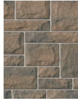
HARBOUR MIST Multi Bundle