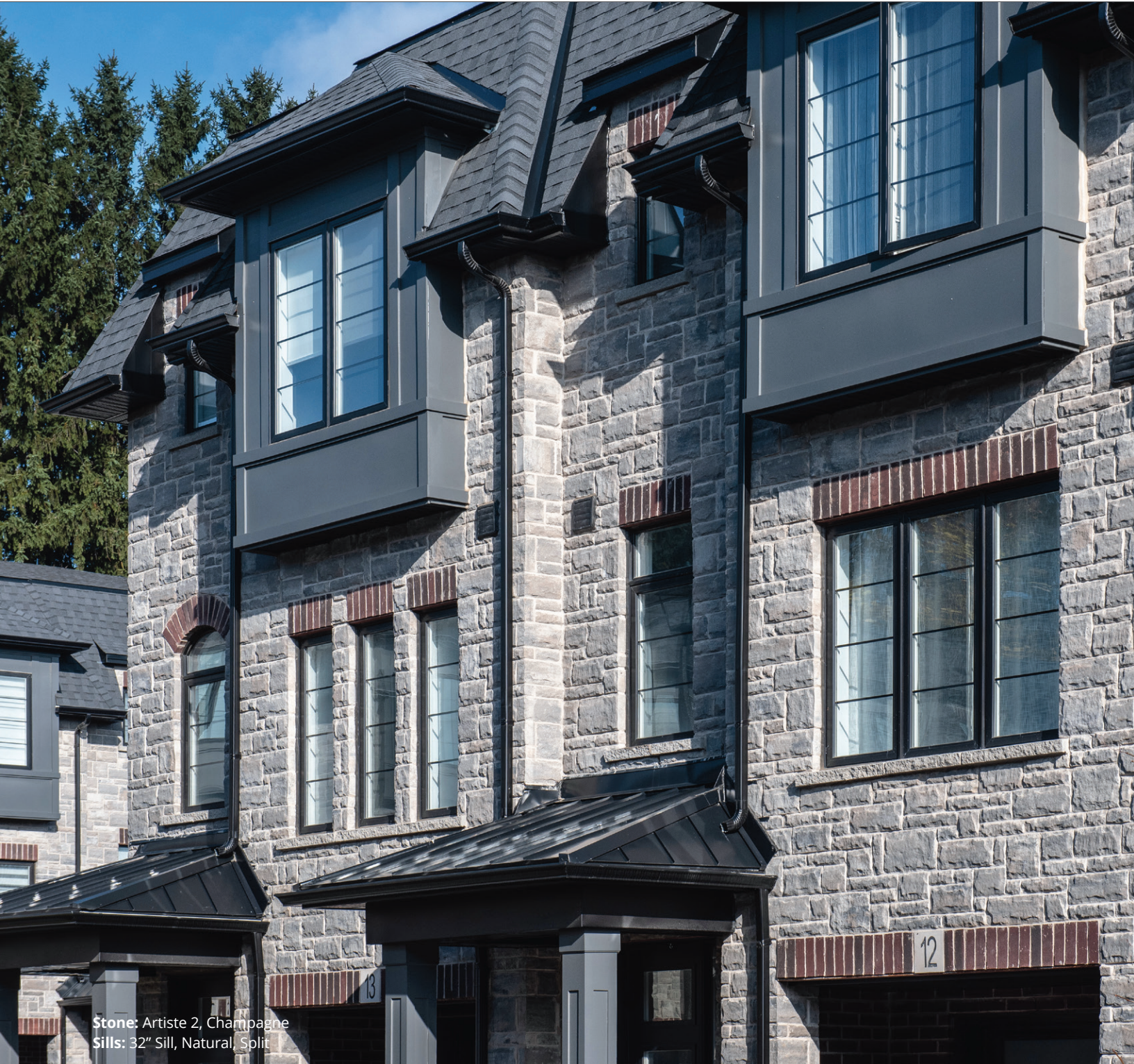
Stone: Artiste 2, Champagne Sills: 32" Sill, Natural, Split

Artiste 2 stone is the next generation of our popular Artiste Stone Masonry: enhanced aesthetics like straight top and bottom edges and beautifully blended new earth tone colours help deliver cleaner lines and a more natural-looking hand-crafted stone appearance. Easier to install with even less waste than the original Artiste. Artiste 2 allows for a variety of configurations by mixing sizes, lengths and combining with other Brampton Brick clay and concrete products.