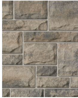
CHAMPAGNE Multi Bundle