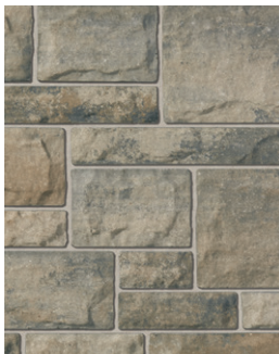
PICASSO Multi Bundle