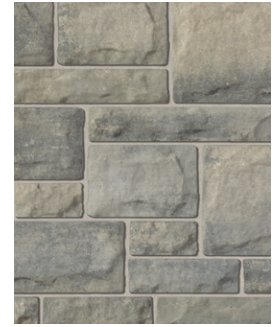
MARBLE GRAY Multi Bundle