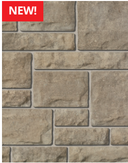
BARISTA Multi Bundle