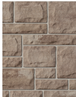
SHORELINE Multi Bundle