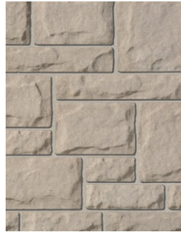
DOVER Multi Bundle